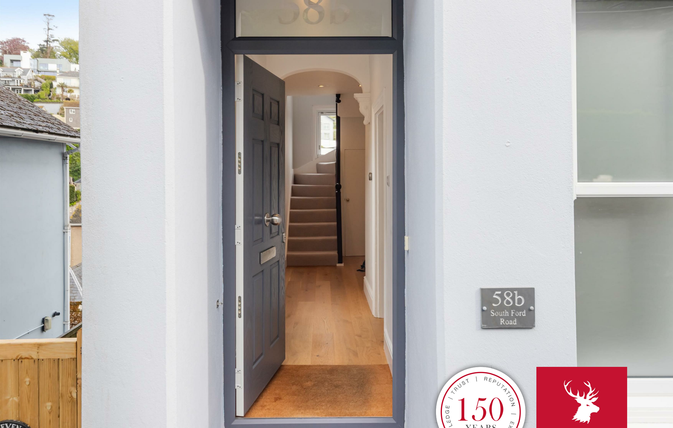
58b, South Ford Road