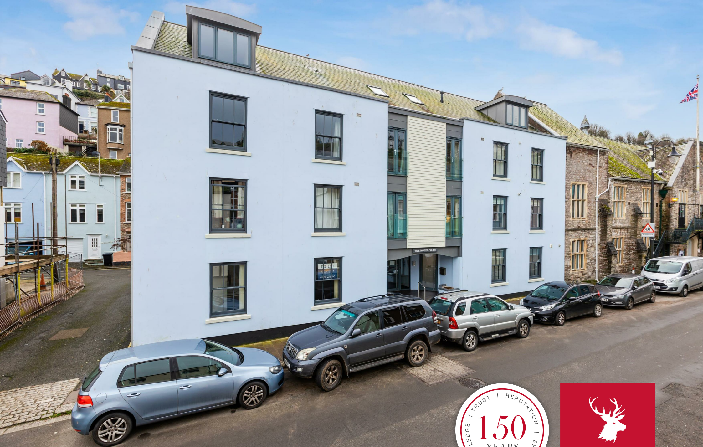
Flat 1, Westwater Court