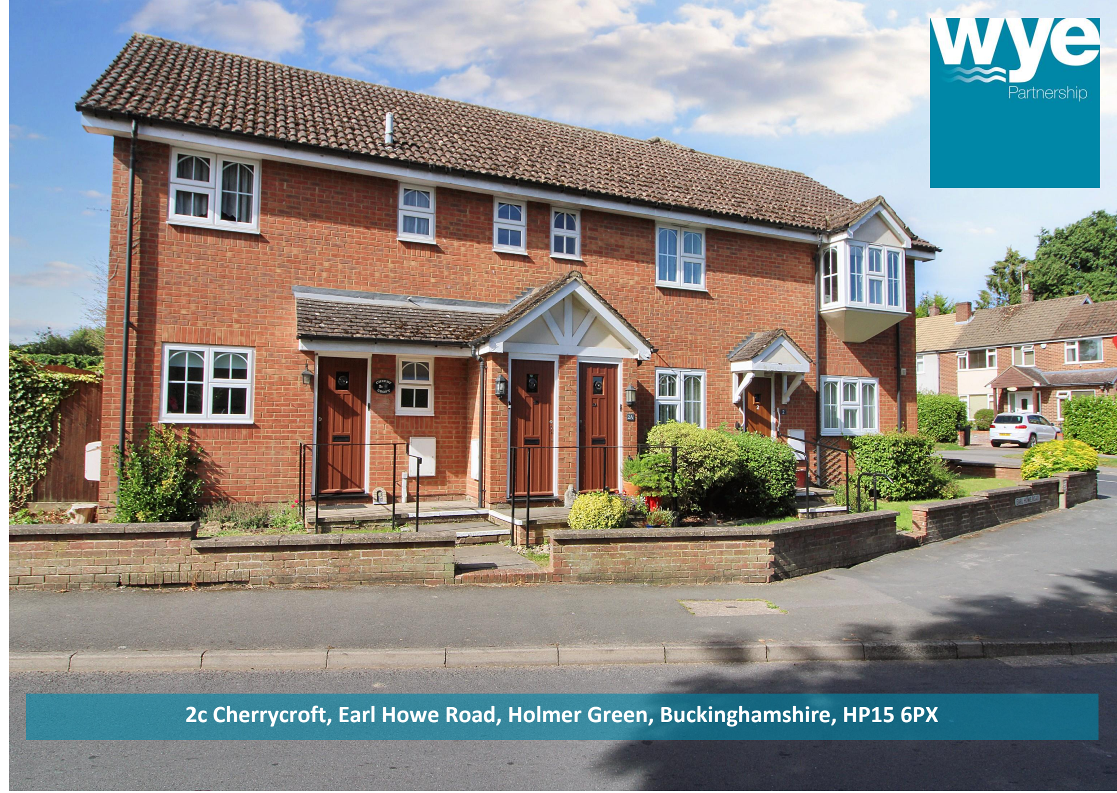
2c Cherrycroft, Earl Howe Road, Holmer Green, Buckinghamshire, HP15 6PX