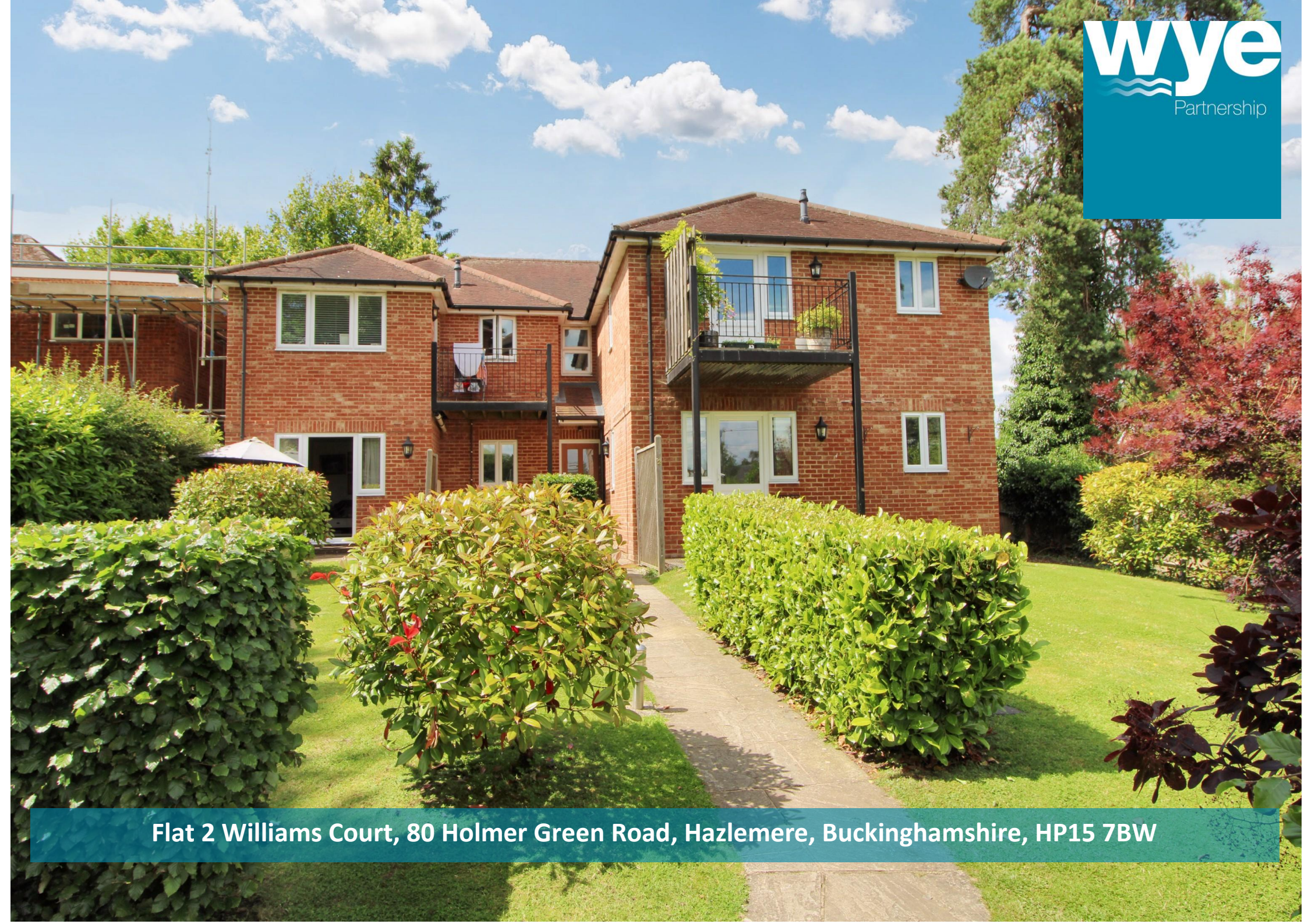
Flat 2 Williams Court, 80 Holmer Green Road, Hazlemere, Buckinghamshire, HP15 7BW