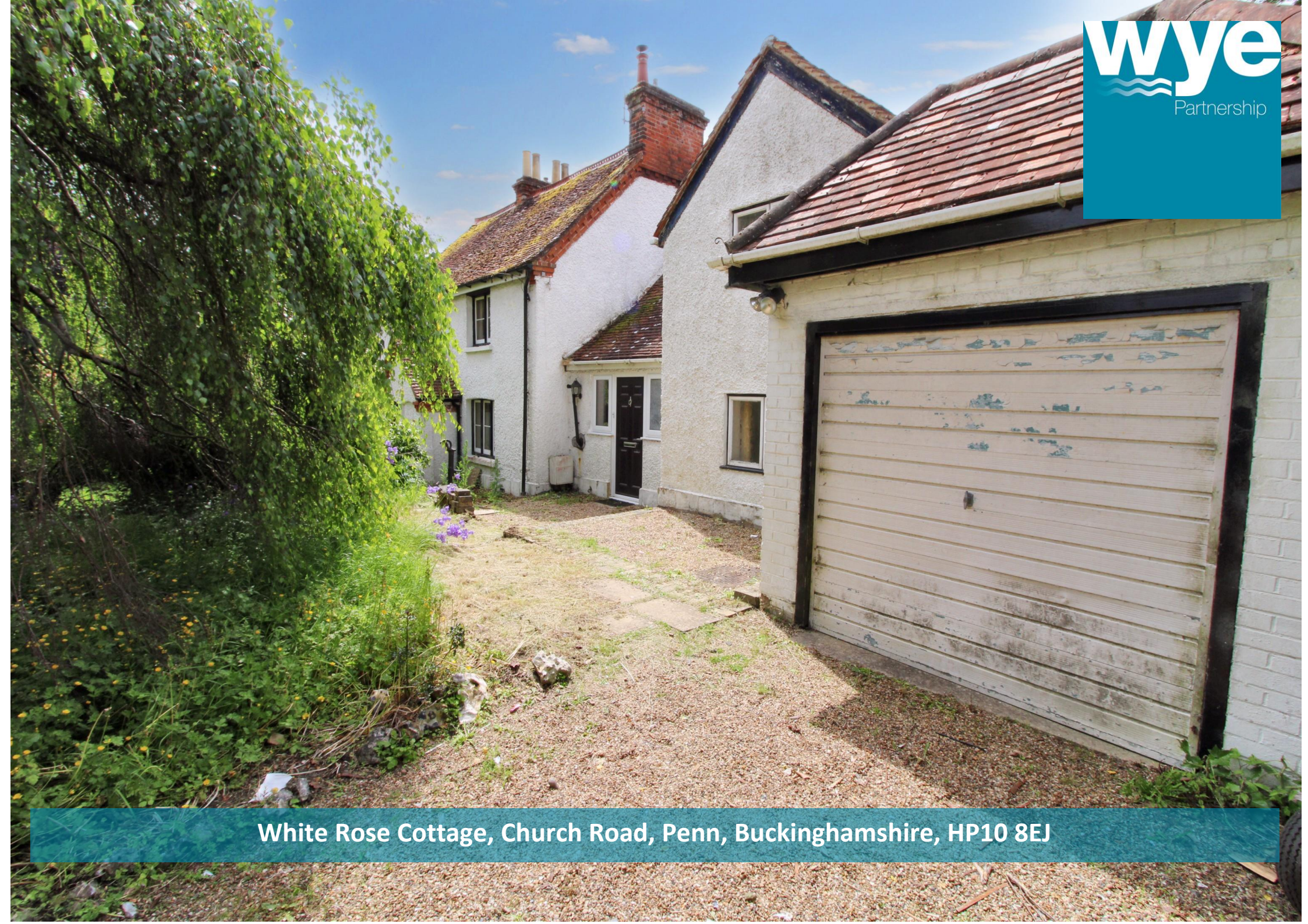
White Rose Cottage, Church Road, Penn, Buckinghamshire, HP10 8EJ