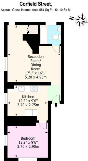
Third Floor Floor Area 551 Sq Ft - 51.19 Sq M

For Illustration Purposes Only - Not To Scale www.lpaplus.com