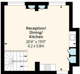
Fifteenth Floor Floor Area 374 Sq Ft - 34.74 Sq M