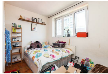
11'6" x 7'6" (3.52 x 2.30)