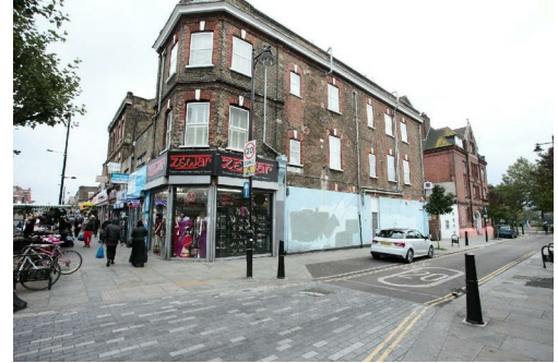
Derby Court, E2 Gross Internal Area 452 Sq Ft - 41.99 Sq M