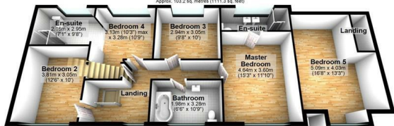
First Floor Approx. 103.2 sq. metres (1111.3 sq. feet)