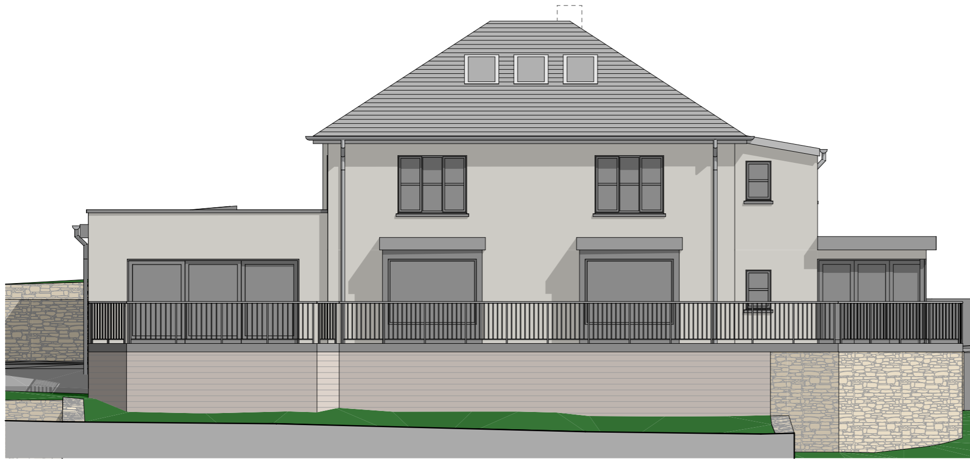
Proposed West Elevation @ 1:100