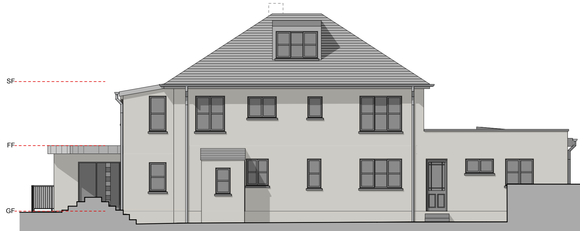
Proposed East Elevation @ 1:100