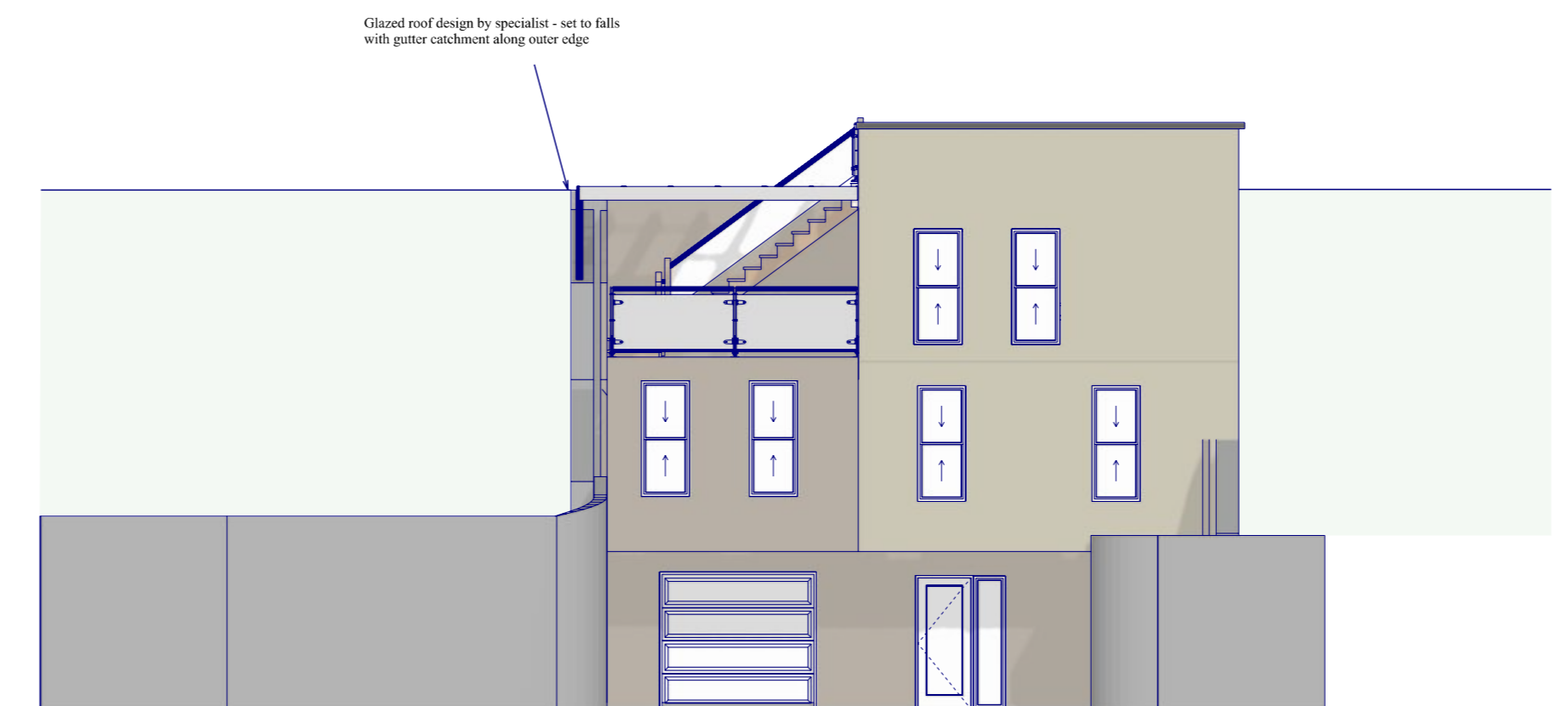
FRONT NORTH EAST SCALE: 1:100