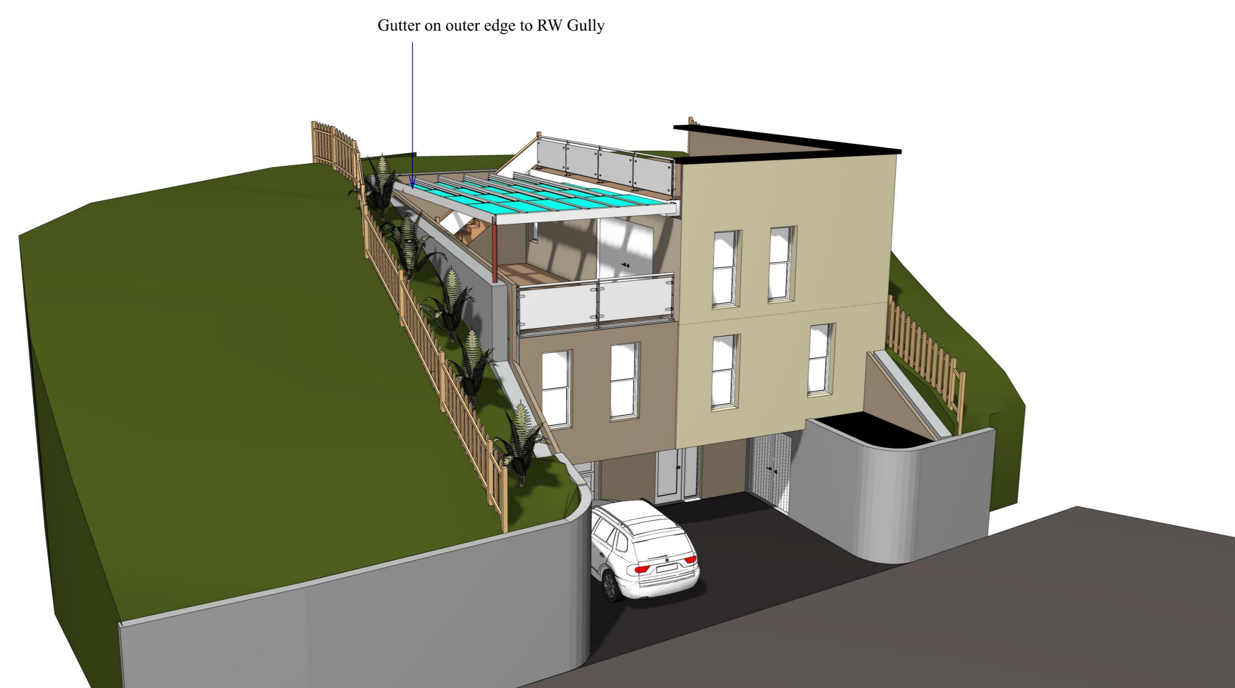
REAR SOUTH WEST SCALE: 1:100