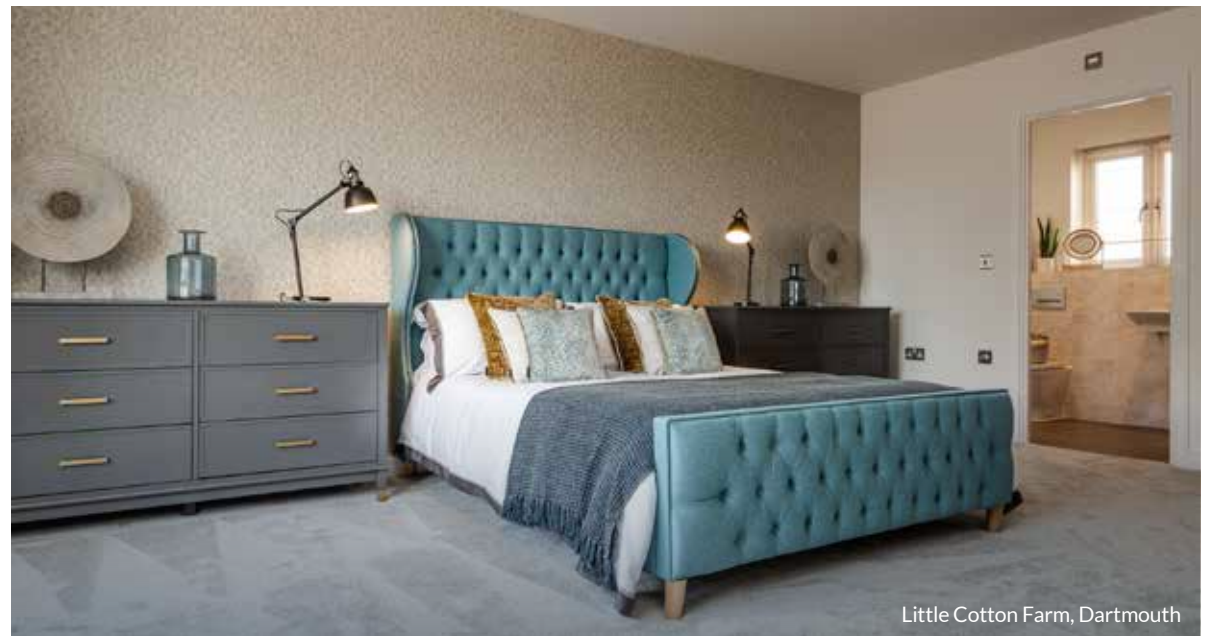
Little Cotton Farm, Dartmouth