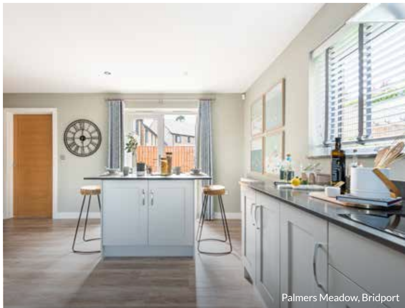
Palmers Meadow, Bridport