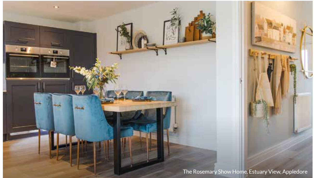
The Rosemary Show Home, Estuary View, Appledore

Baker Estates – good things happen here.