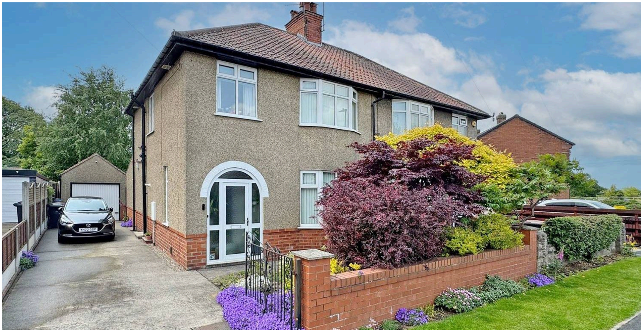
47 Birstwith Road, Harrogate Harrogate