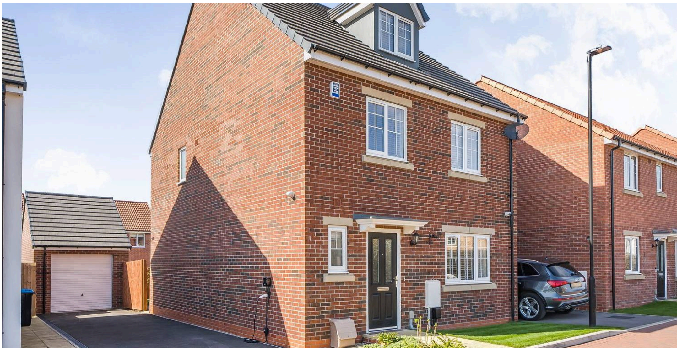
16 Pearl Close, Knaresborough Knaresborough