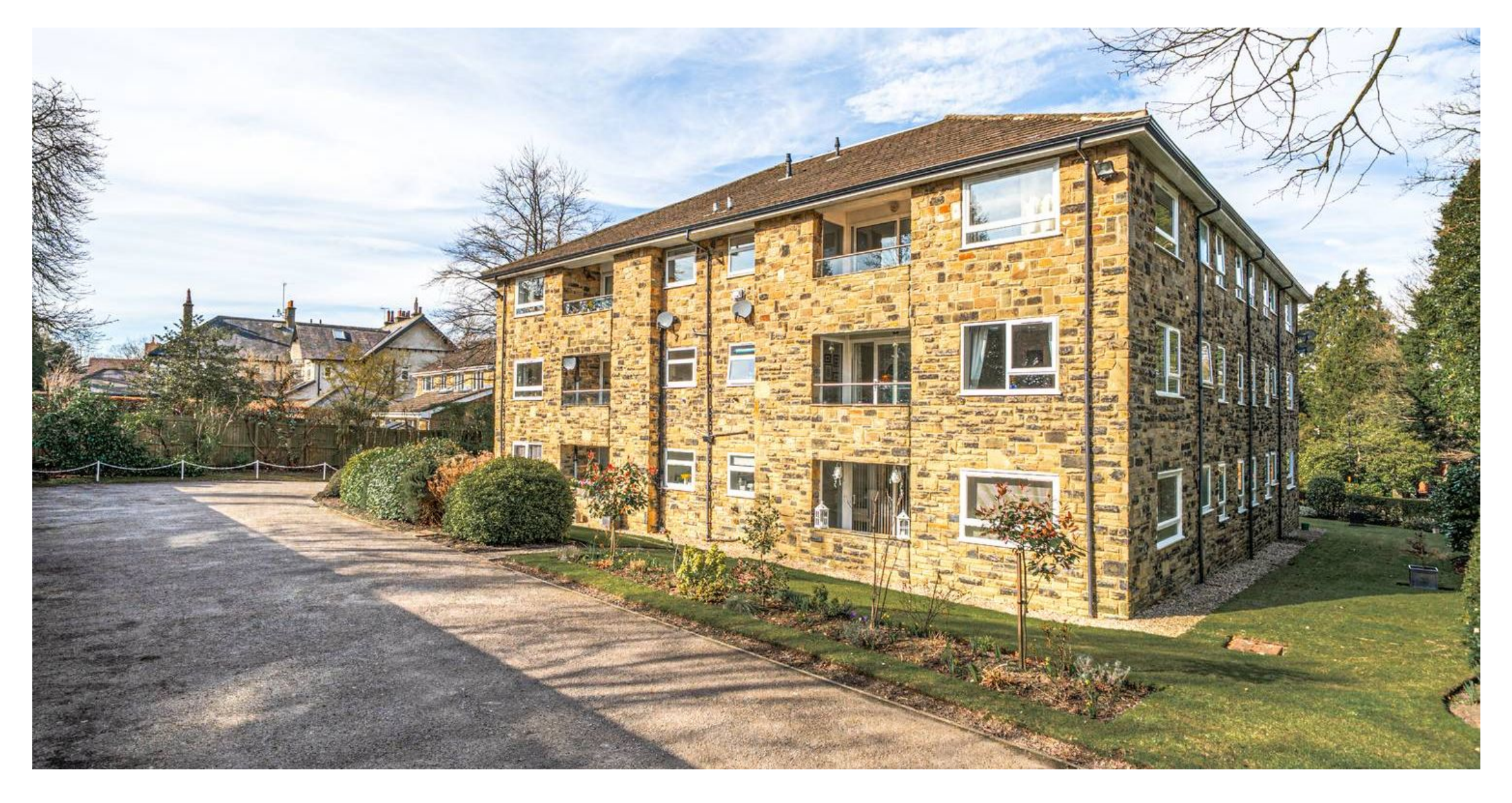
Flat 7, Duchy Grange Kent Road, Harrogate Harrogate