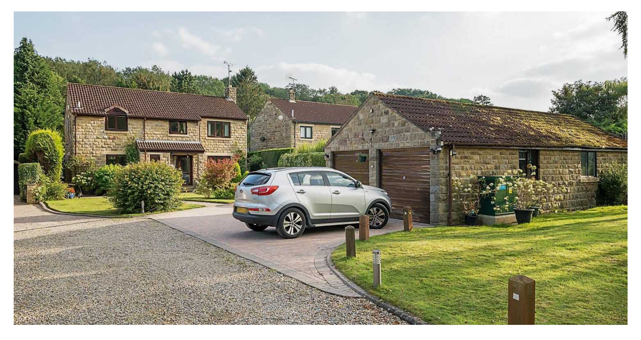
3 Abbey Court Abbey Road, Knaresborough Knaresborough