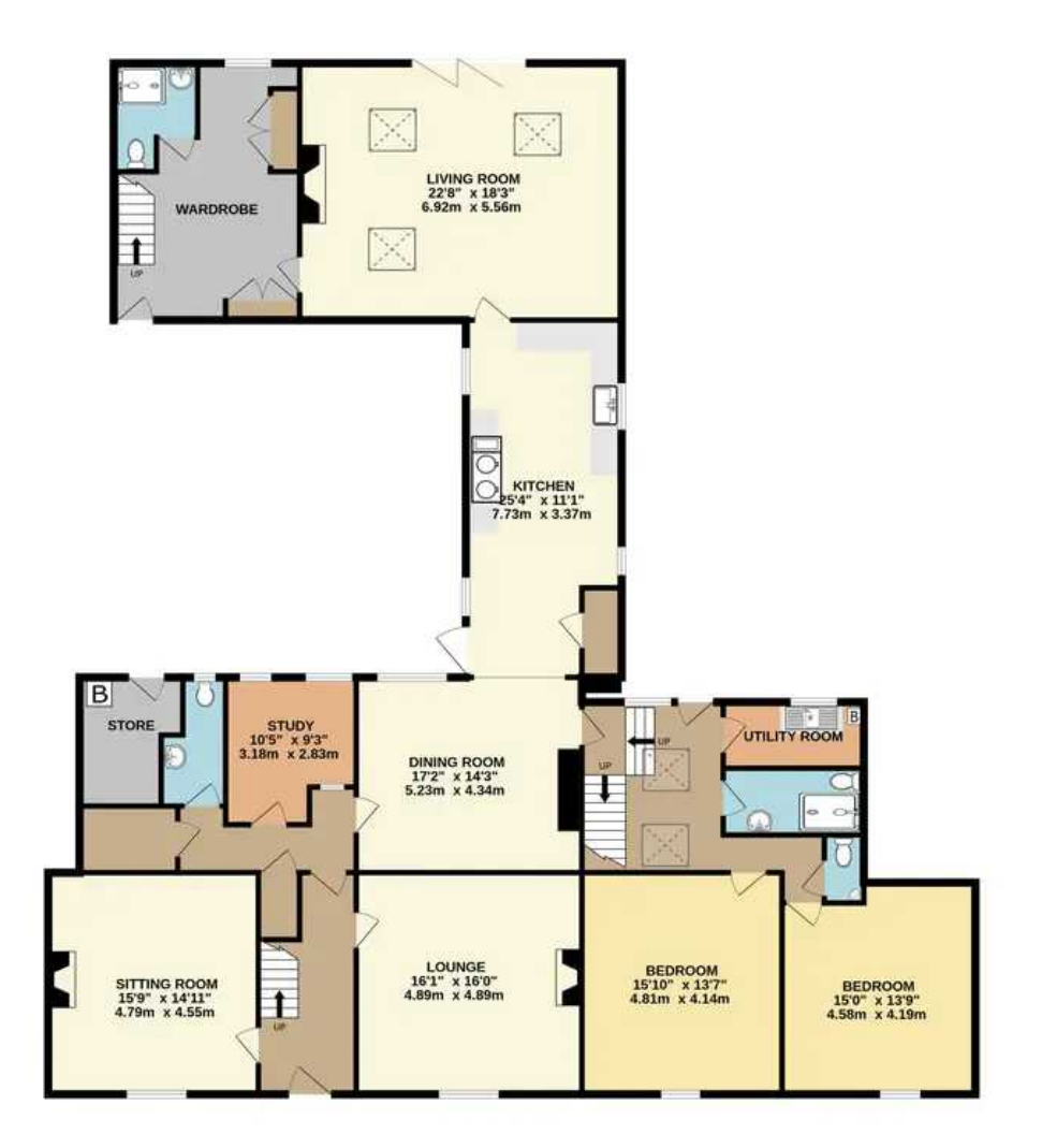
1ST FLOOR 1727 sq.ft. (160.4 sq.m.) approx.