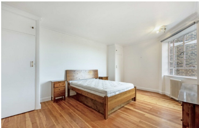
Nightingale Lane, SW12