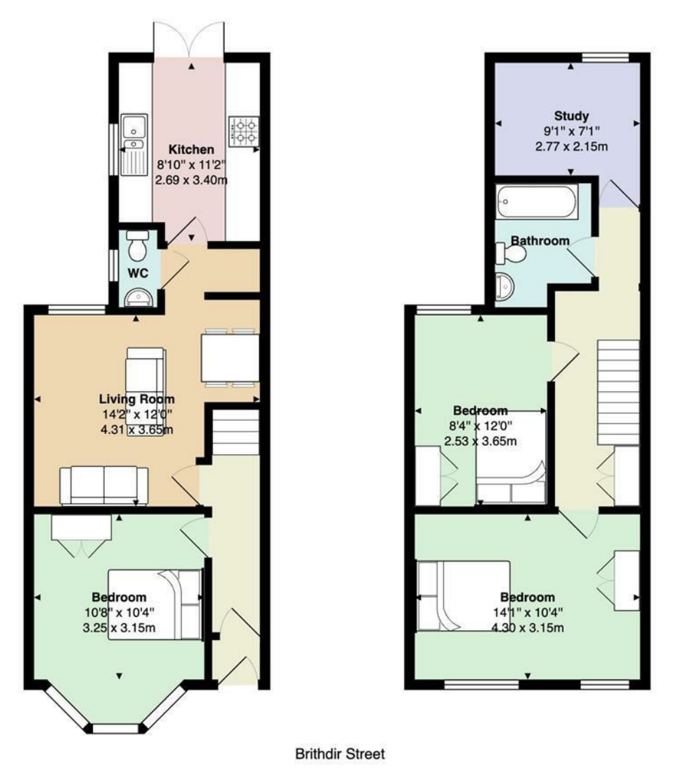
Total Area: 942 ft<sup>2</sup> ... 87.6 m<sup>2</sup> All measurements are approximate and for display purposes only