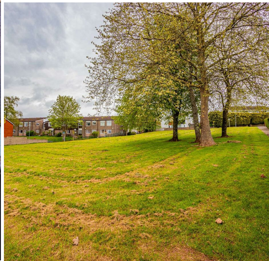
Coeden Dal, Pentwyn, Cardiff