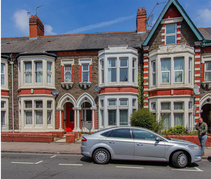
Albany Road, Roath