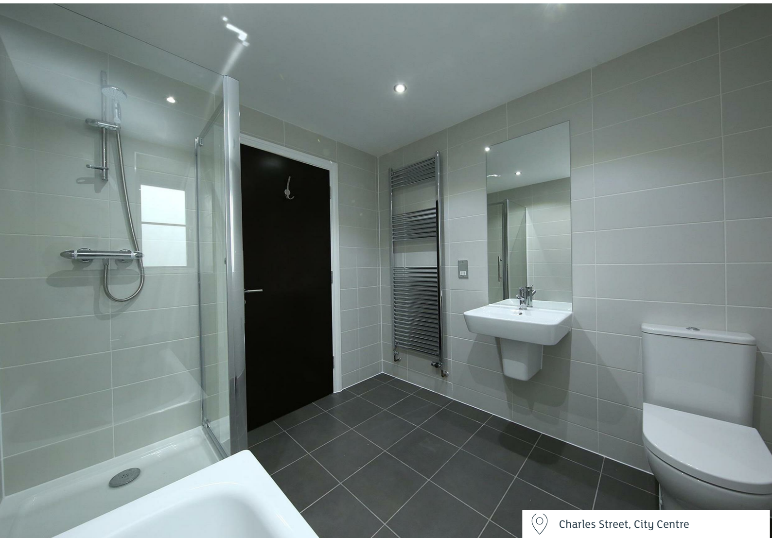
Charles Street, City Centre