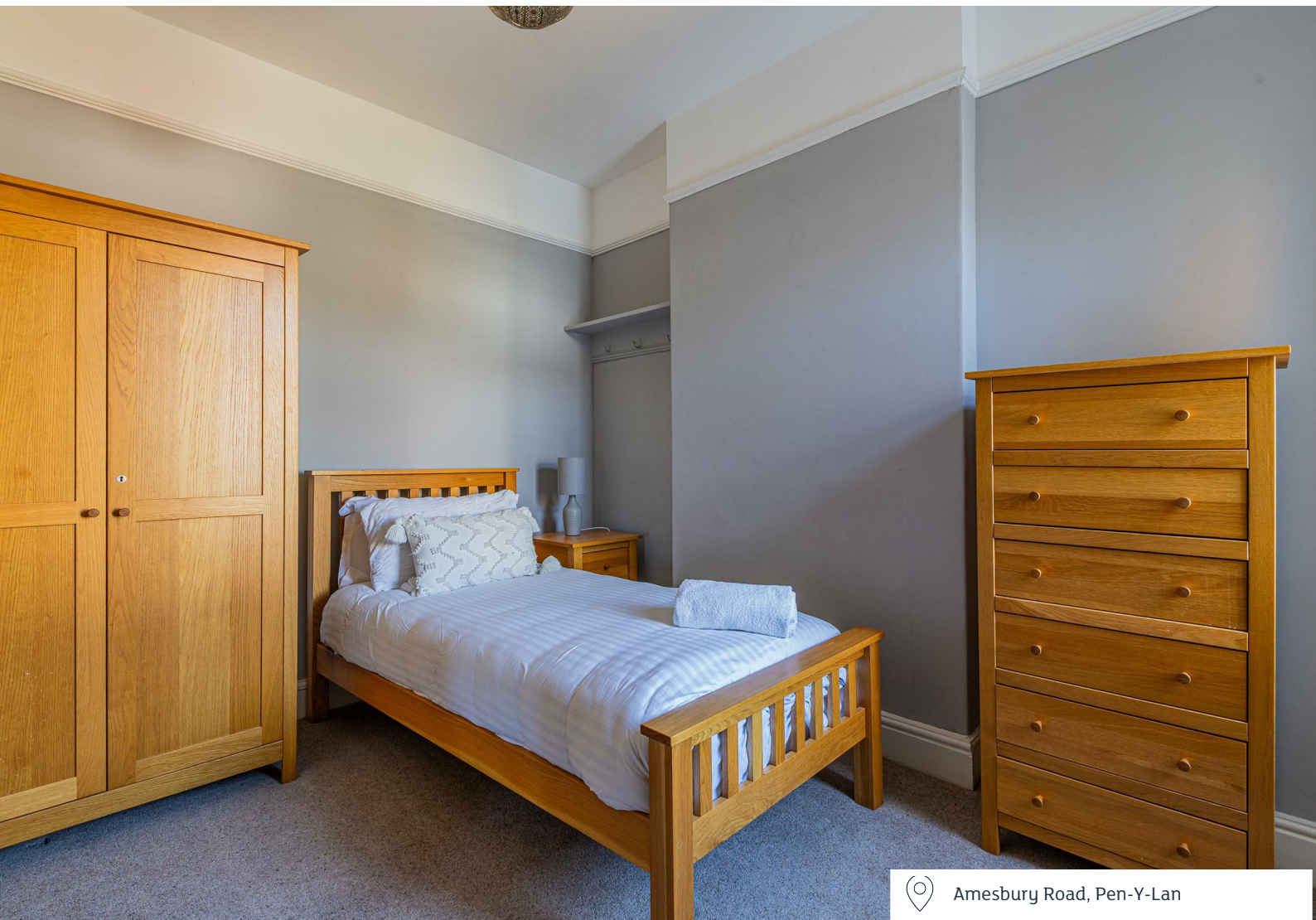
Amesbury Road, Pen-Y-Lan