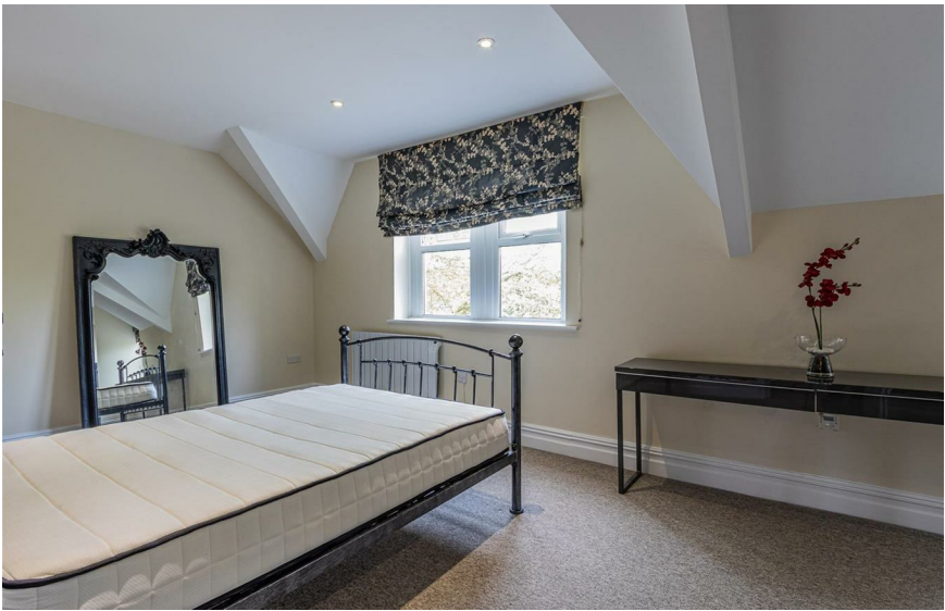
Penylan Road CF23 5HX