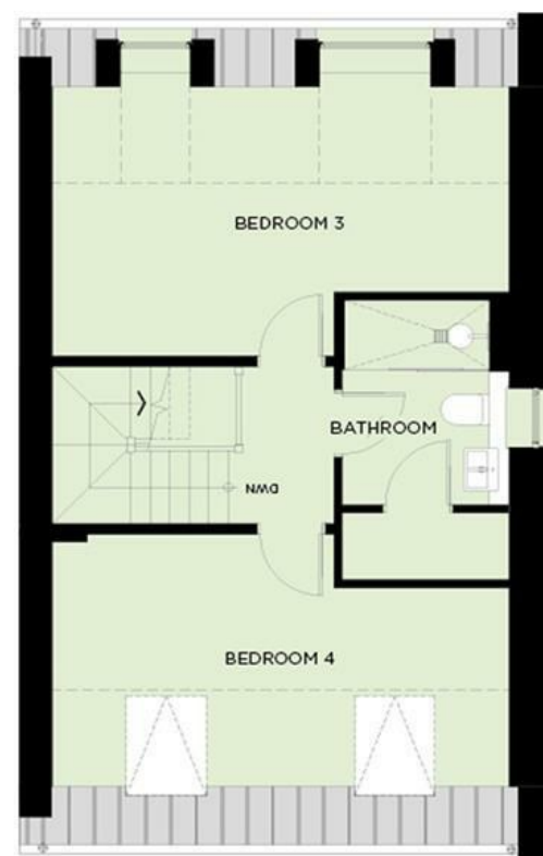
SEVERN QUAY GARDENS 4 BEDROOM LAYOUT