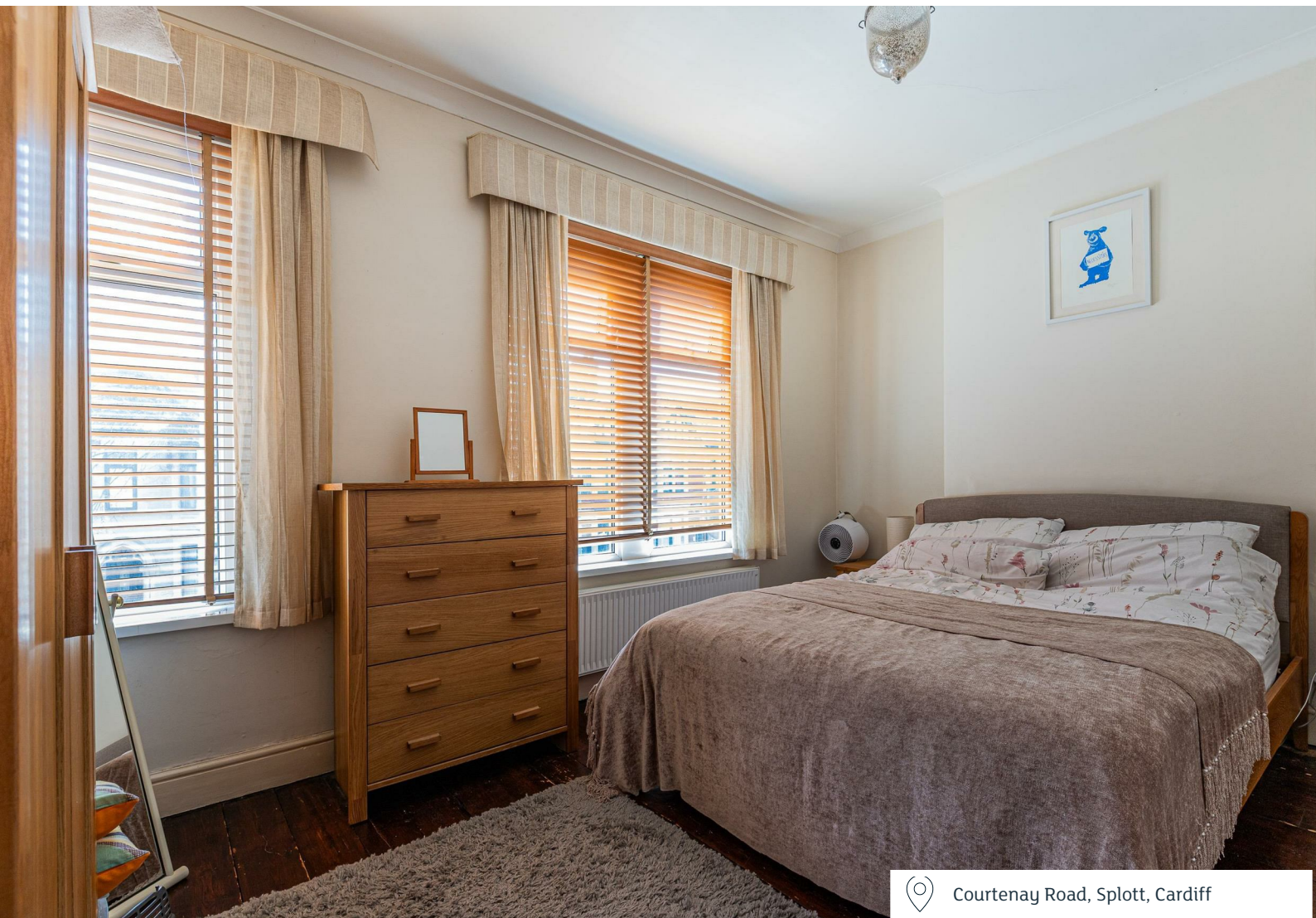
Courtenay Road, Splott, Cardiff