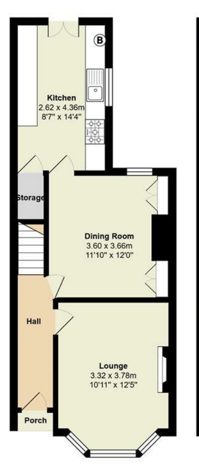
Total Area: 88.9 m<sup>2</sup> ... 957 ft<sup>2</sup> All measurements are approximate and for display purposes only