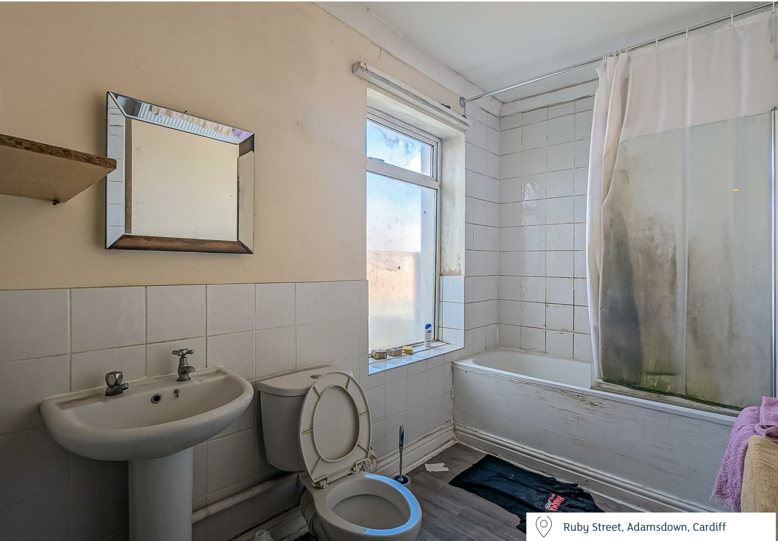
Ruby Street, Adamsdown, Cardiff