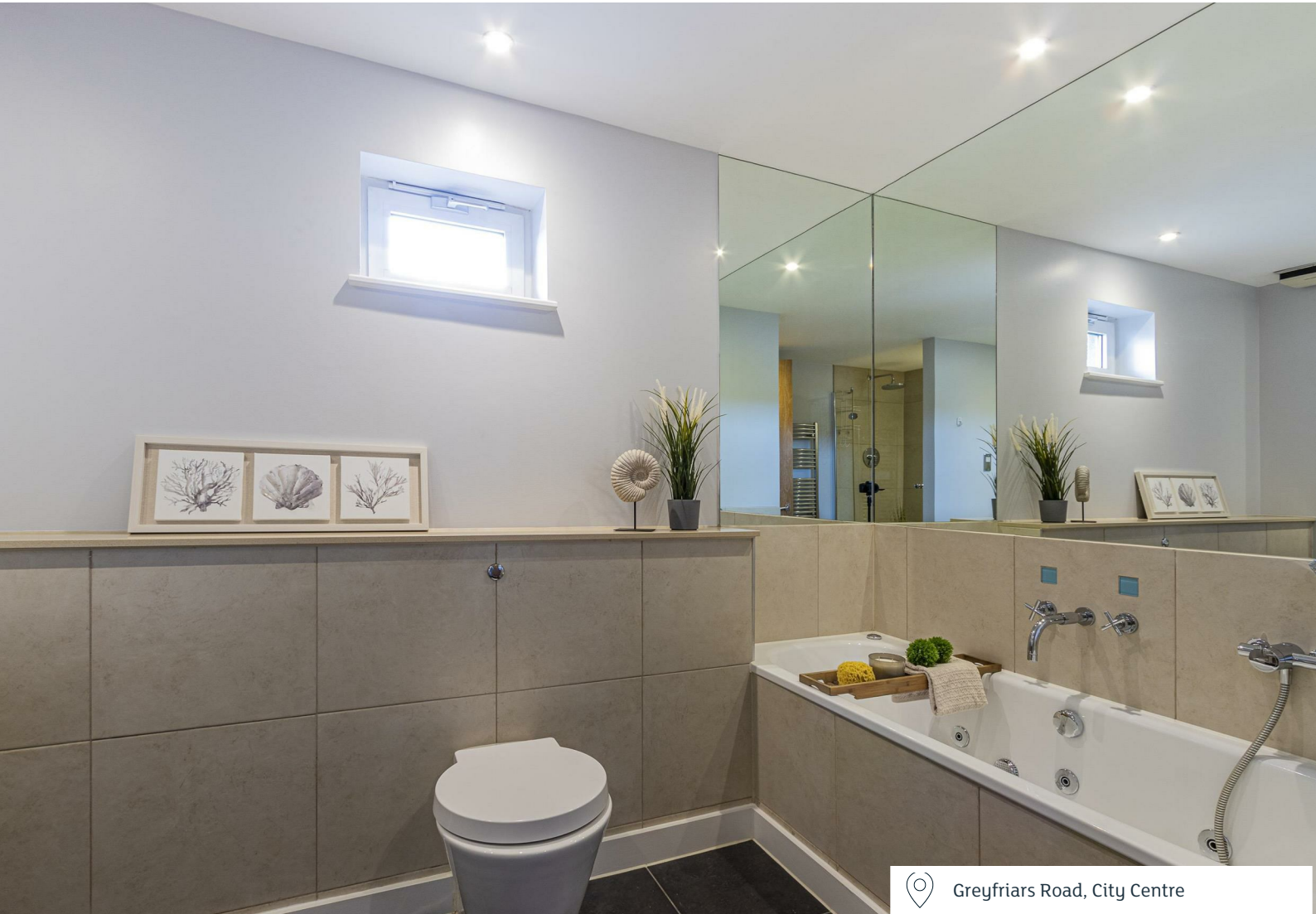
Greyfriars Road, City Centre