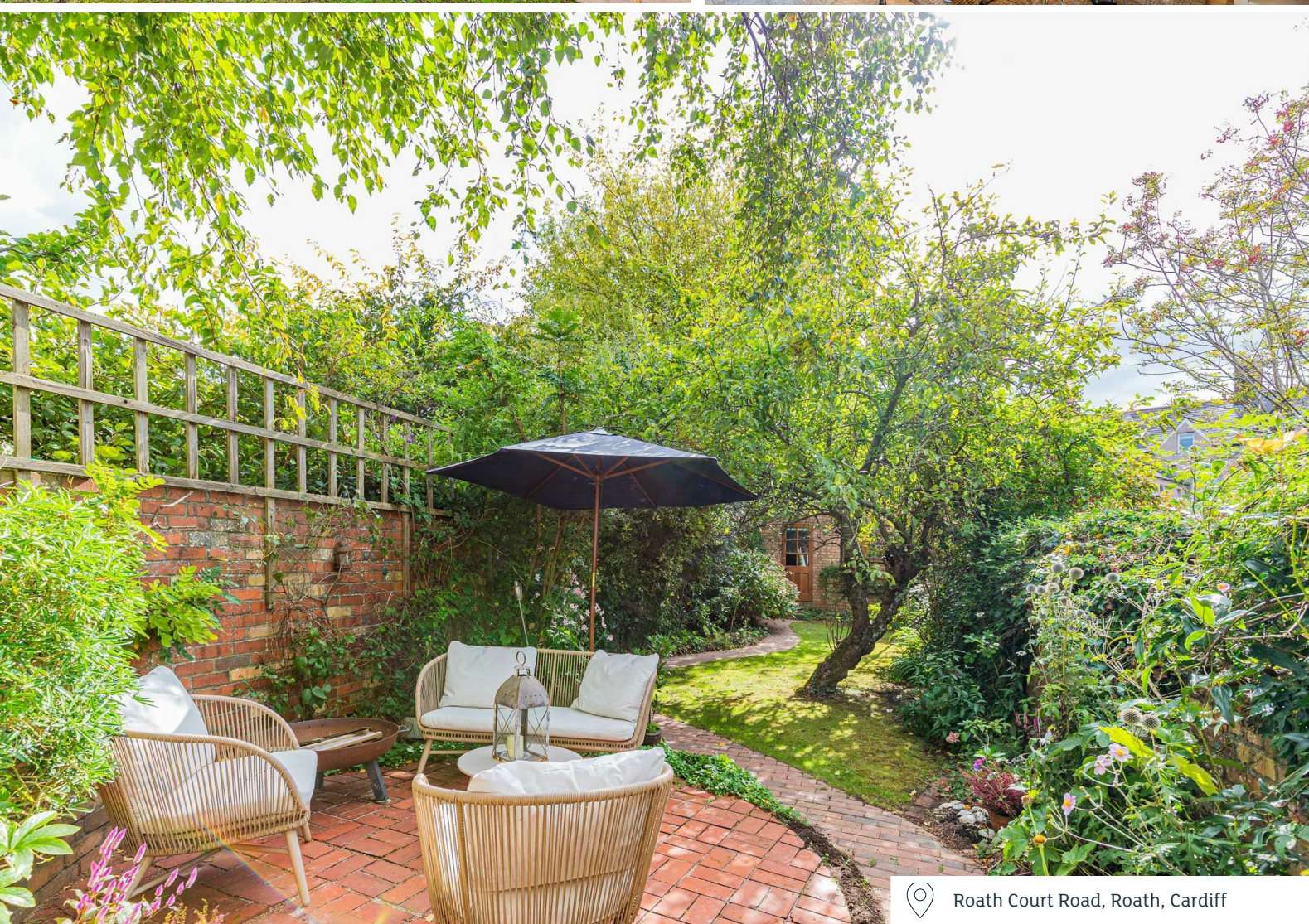
Roath Court Road, Roath, Cardiff