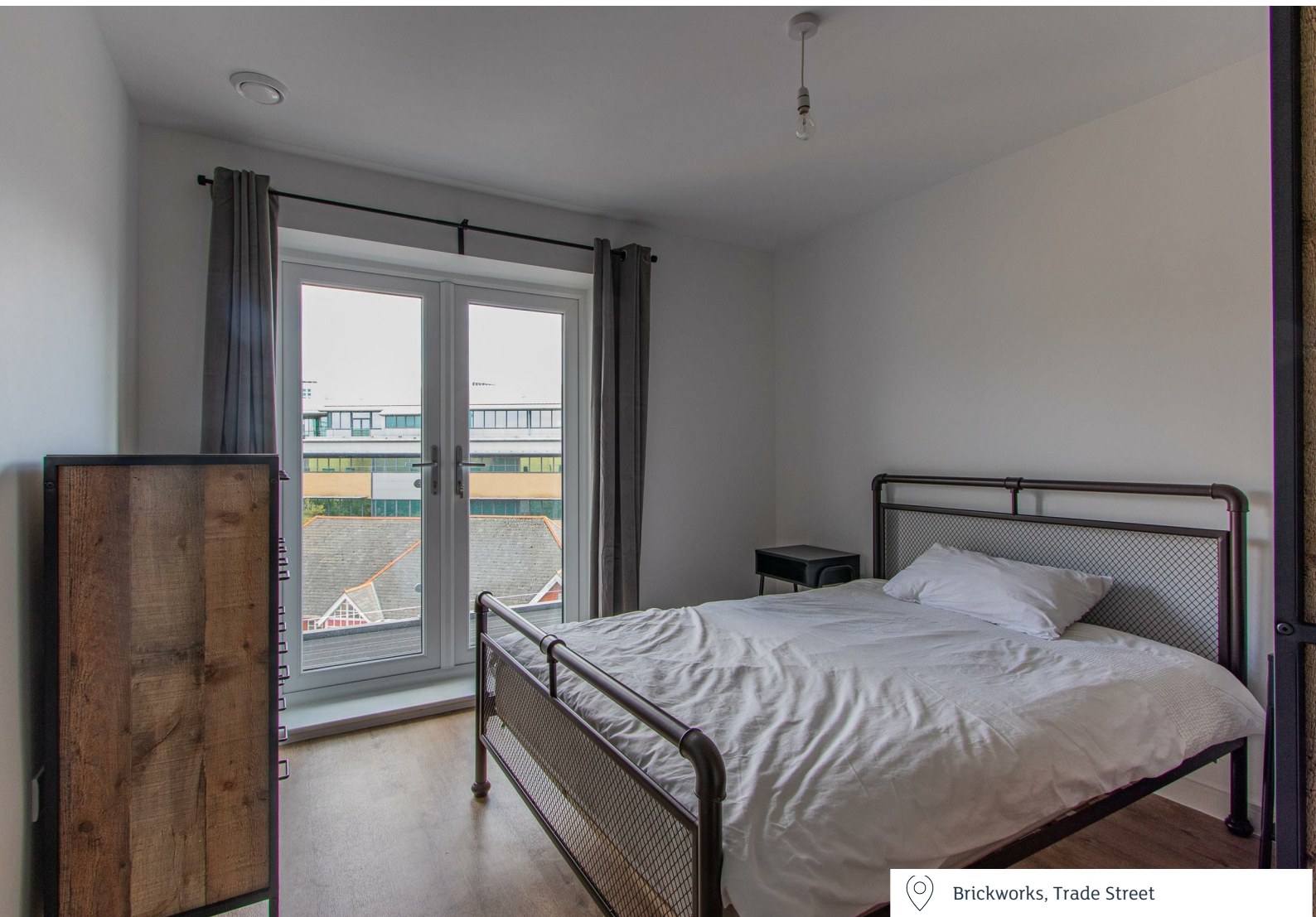
Brickworks, Trade Street