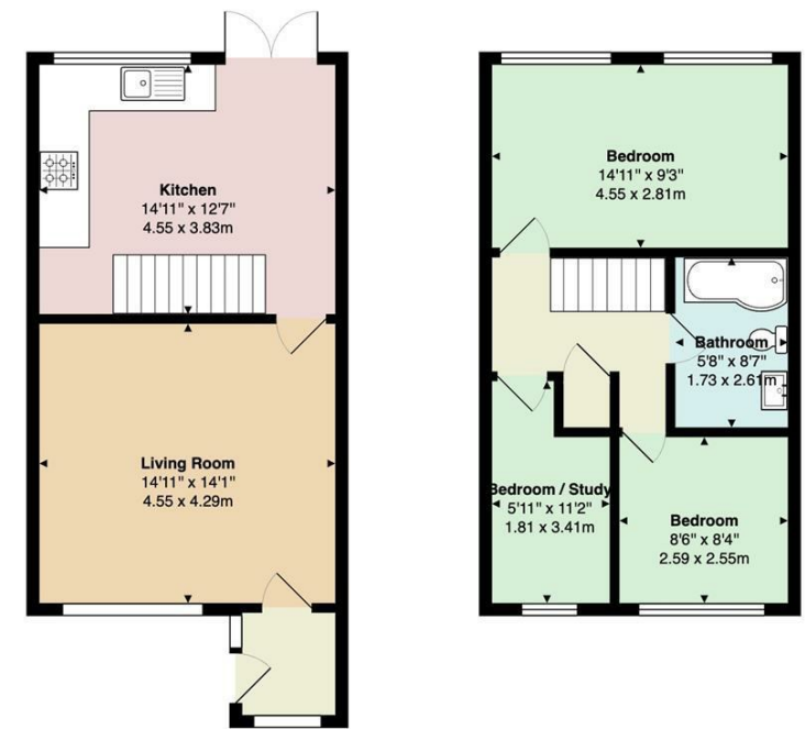
The Hawthorns Total Area: 837 ft² ... 77.7 m² All measurements are approximate and for display purposes only