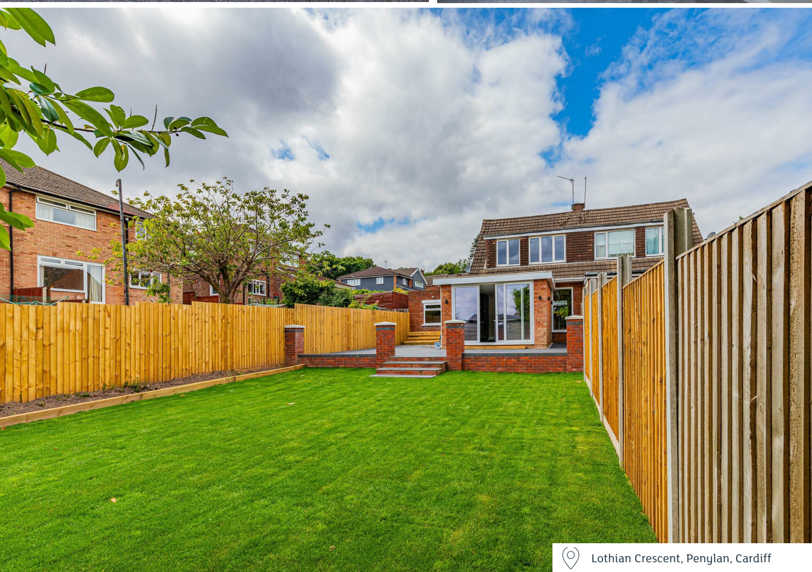
Lothian Crescent, Penylan, Cardiff