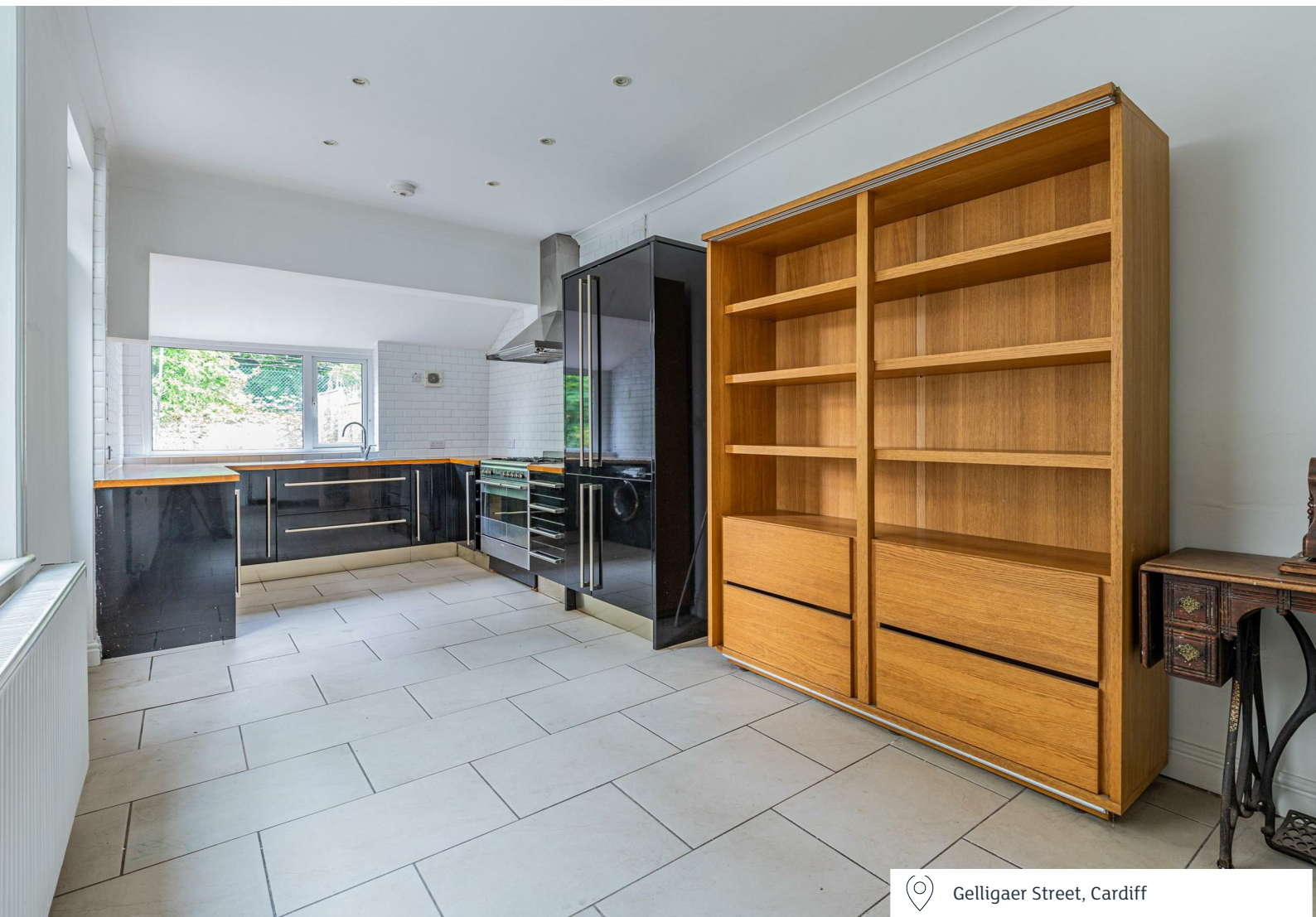
Gelligaer Street, Cardiff