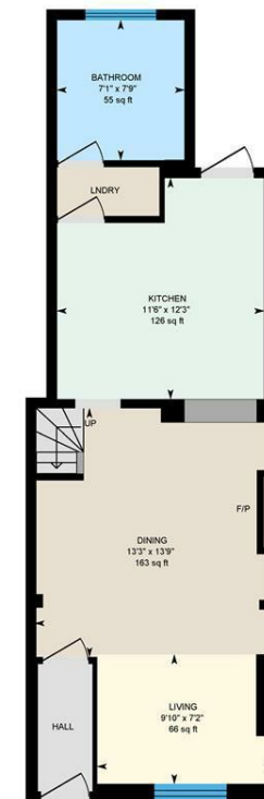
Ground Floor Interior Area 481.85 sq ft

Main Building: Total Interior Area 743.99 sq ft