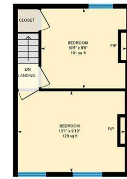
1st Floor Interior Area 262.14 sq ft