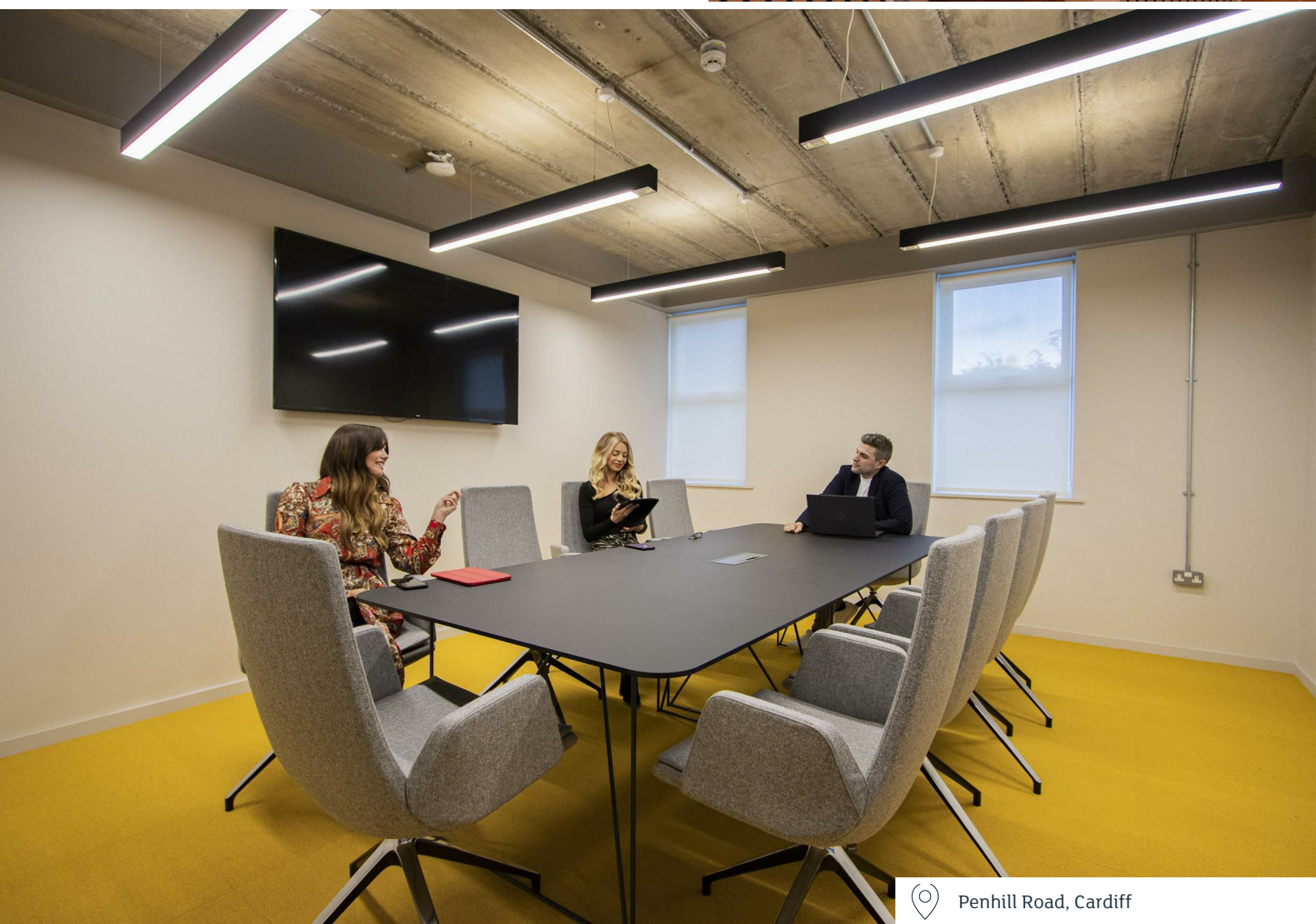
Penhill Road, Cardiff