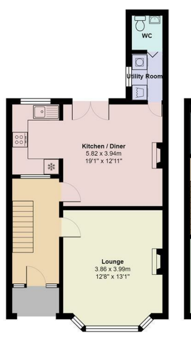
Total Area: 100.9 m<sup>2</sup> ... 1086 ft<sup>2</sup> ements are approximate and for display purp