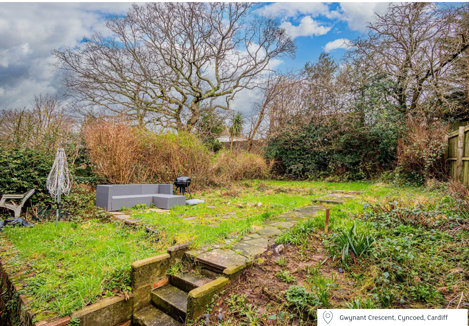
Gwynant Crescent, Cyncoed, Cardiff

White regions are excluded from total floor area in iGUIDE floor plans. All room dimensions and floor areas must be considered approximate and are subject to independent verification.