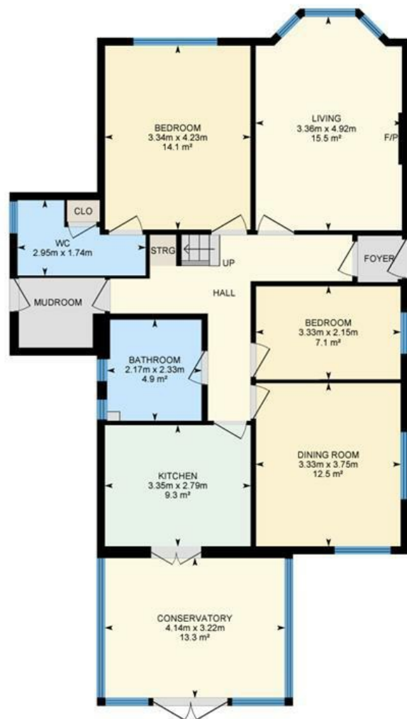
Ground Floor Interior Area 100.80 m 2

Main Building: Total Interior Area Above Grade 117.44 m 2