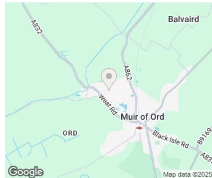
Illustration For Identification Purposes Only. Not To Scale (ID1206171 / Ref:90648)