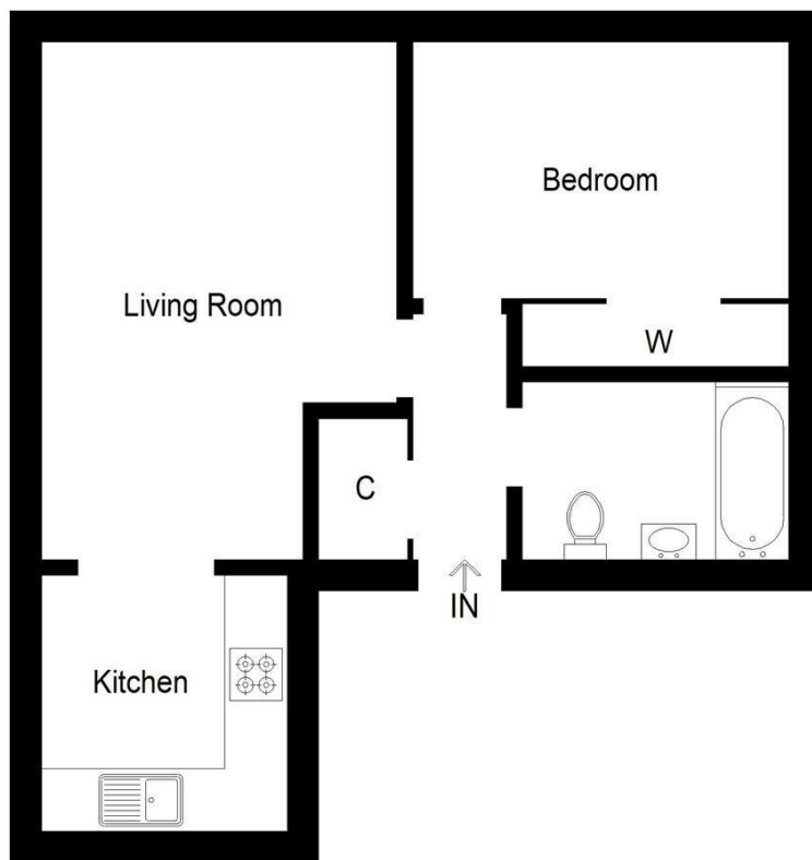
Illustration For Identification Purposes Only. Not To Scale (ID1191616 / Ref:90391)