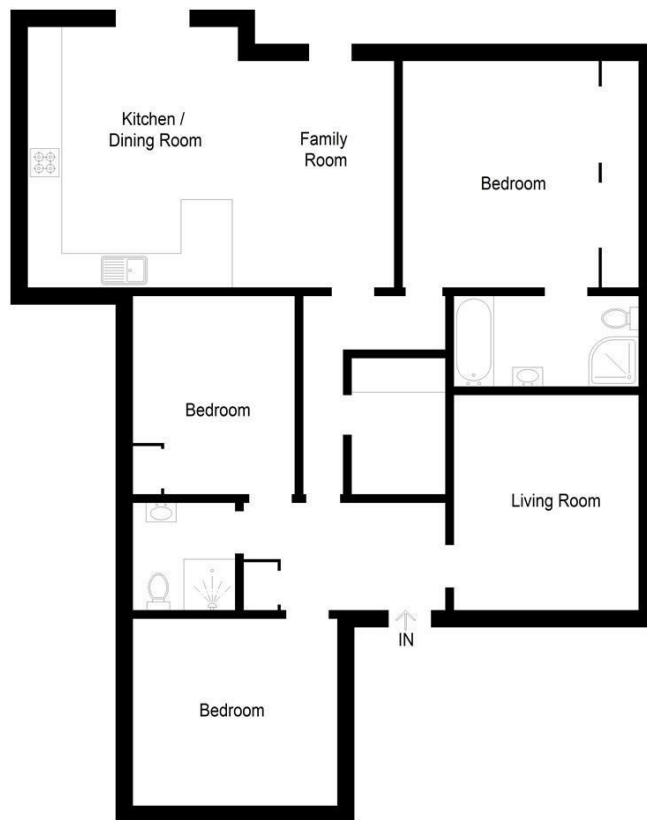
Illustration For Identification Purposes Only. Not To Scale (ID1197444 / Ref.90499)