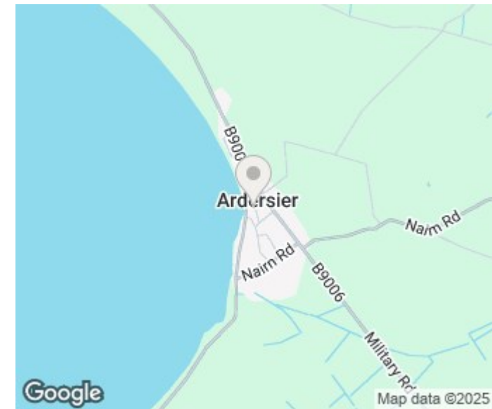
Illustration For Identification Purposes Only. Not To Scale (ID:1196455 / Ref:90482)