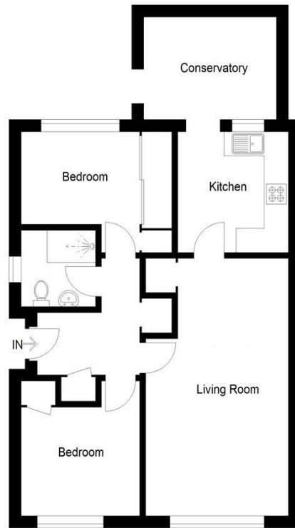
Illustration For Identification Purposes Only. Not To Scale (ID:1194508 / Ref:90446)