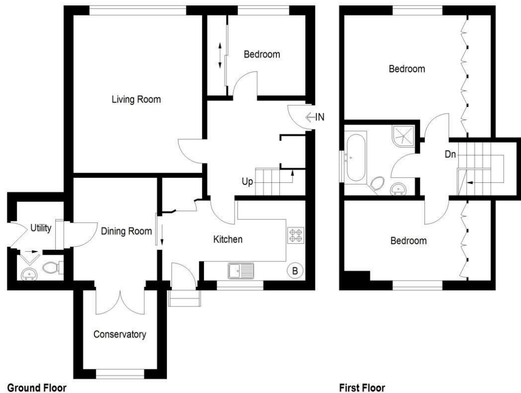
Illustration For Identification Purposes Only. Not To Scale (ID:1099241 / Ref:88521)