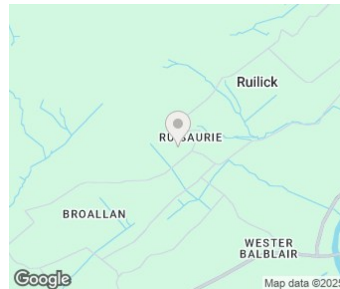
Illustration For Identification Purposes Only. Not To Scale (ID:1184918 / Ref:90292)