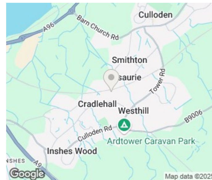
Illustration For Identification Purposes Only. Not To Scale (ID:1183643 / Ref:90269)