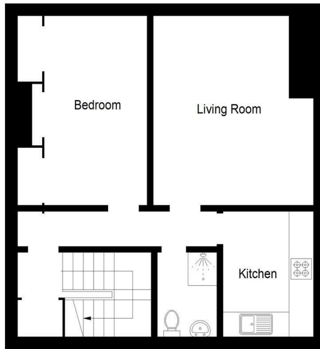
Illustration For Identification Purposes Only. Not To Scale (ID:1150167 / Ref:89672)